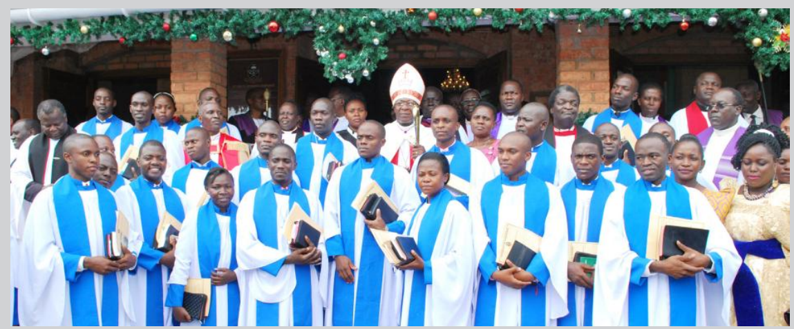
A group photo of Lay Readers with the Bishop, Dean and other Clergy