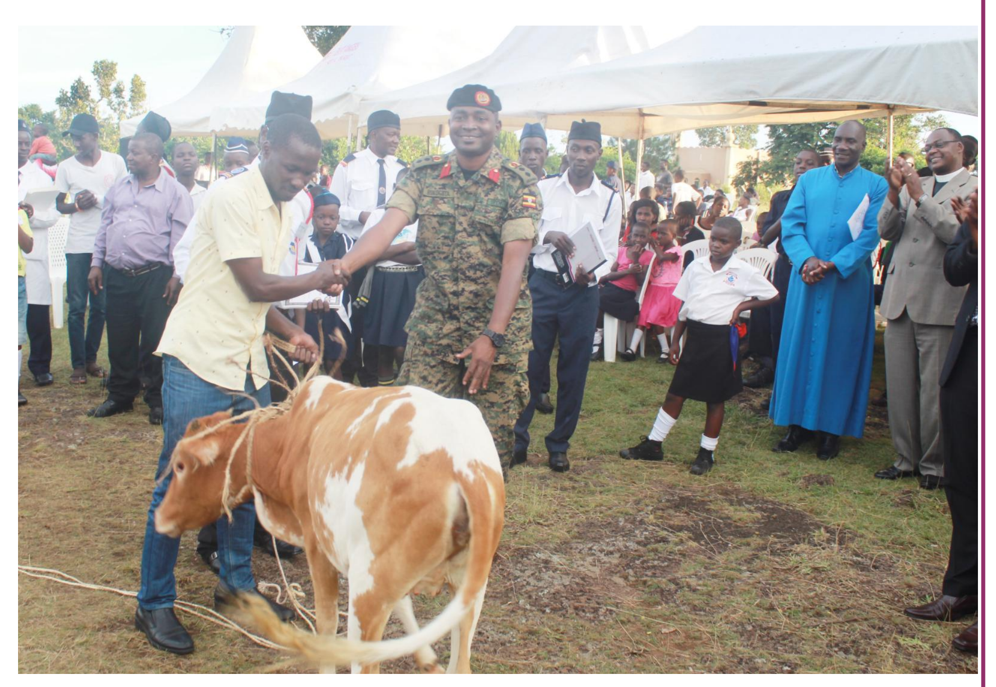
The guest handing over a cow to participants. Refer to the next page for the story (Page 7)