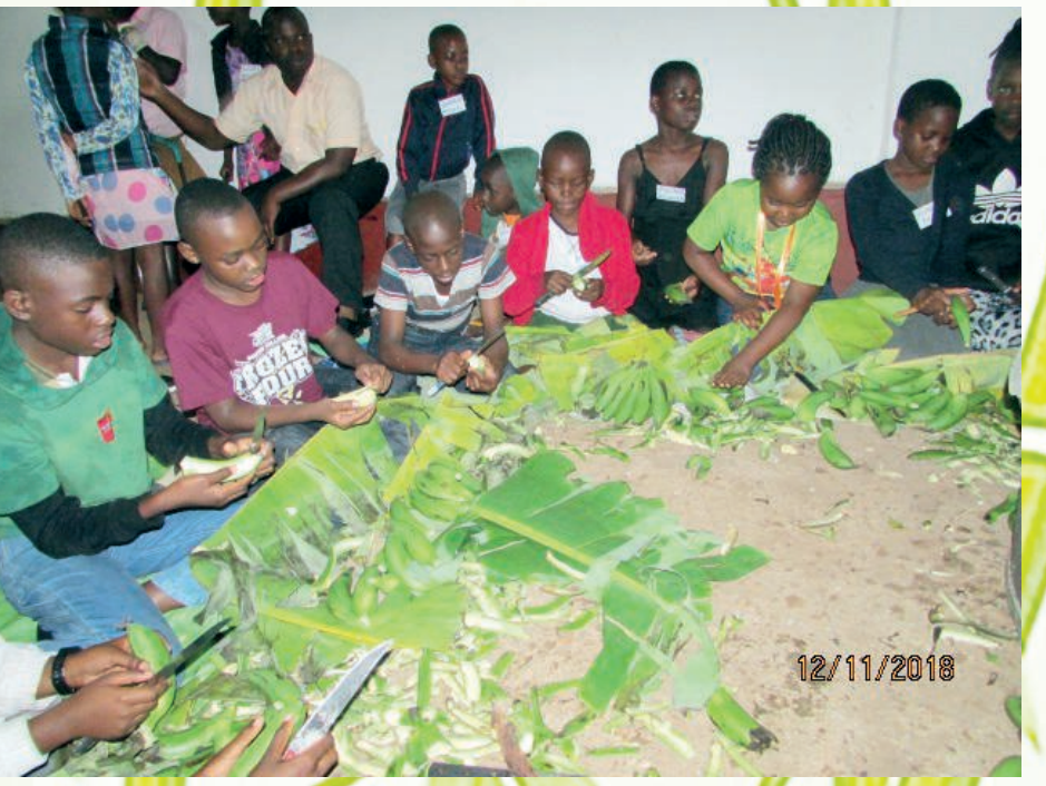
Children at work

ver 100 Sunday school children were trained in domestic work and their lives improved morally and spiritually in a highly organised training camp by the Children's ministry. The camp which was held at St. Lawrence Crown City Campus started on 9th and ended on 13th December and targeted children between 7-14 years. Each child paid Ug shs100,000/= which catered for their accommodation.