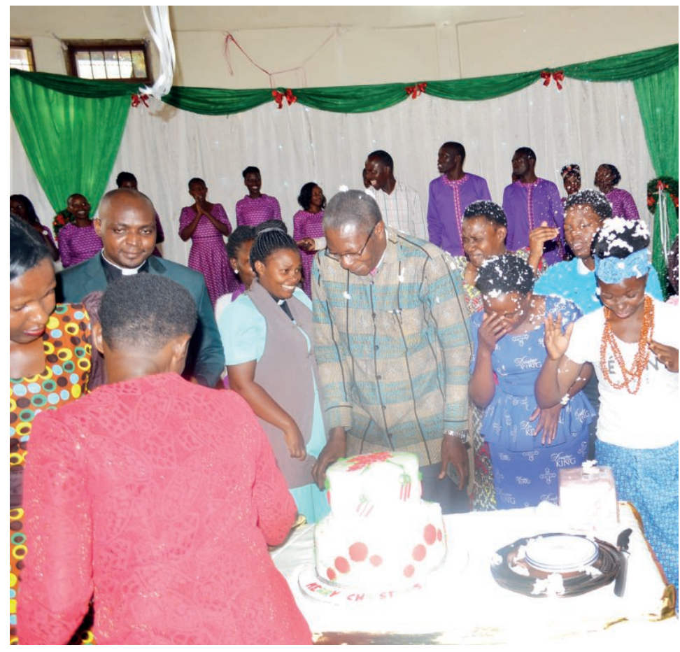
Bishop cutting the cake

Youth Conference Preparations in high gear