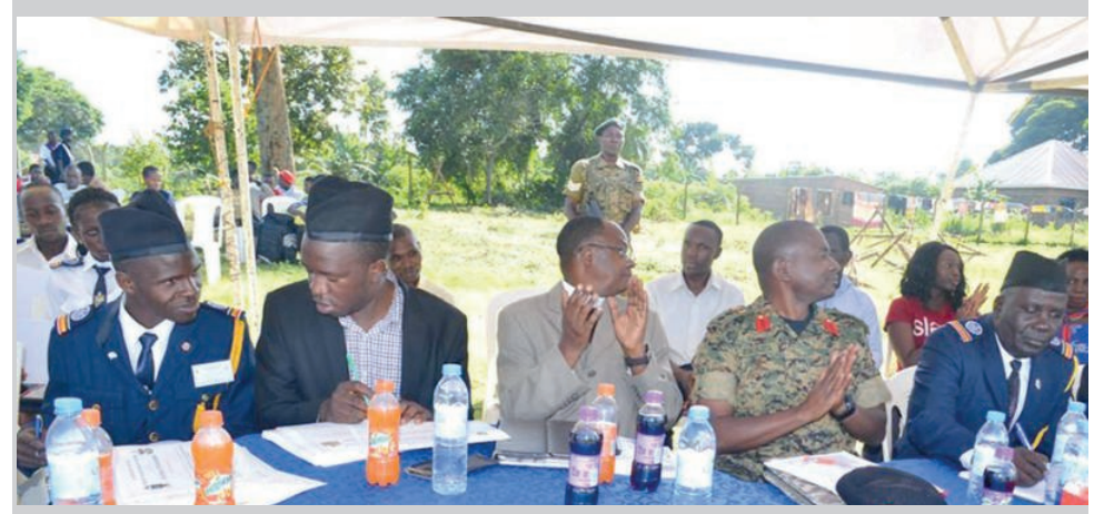
The Youth Secretary and other guests

vouth in Namirembe Diocese dedicated 2019 to be a Bugiri year and this resolution was reached in the last Youth Diocesan Council that was held from Bishop Ssekadde Hall in October this year. Bugiri is strategically located on the shores of lake victoria in Nkumba Parish- Entebbe Archdeaconry in Wakiso district and it sits approximately on 13 acres of land. Developing this site will be long term and a lot of money is needed. A modern youth Beach will be setup that will be managed under the values of the Church. We also intend to install permanent lights since electricity is already available.