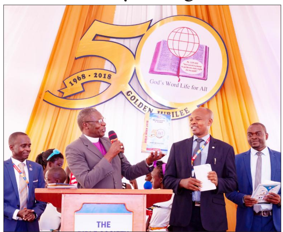
Bishop addressing the congregation at the Bible Society of Uganda celebrations

y most effusive congratulations Bible ■Society of Uganda for your 50 years of Bible ministry that proclaims the glory of Our Lord Iesus Christ. To reach 50 years is not easy, but God is faithful in accomplishing his