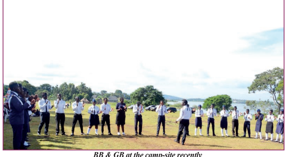
BB & GB at the camp-site recently