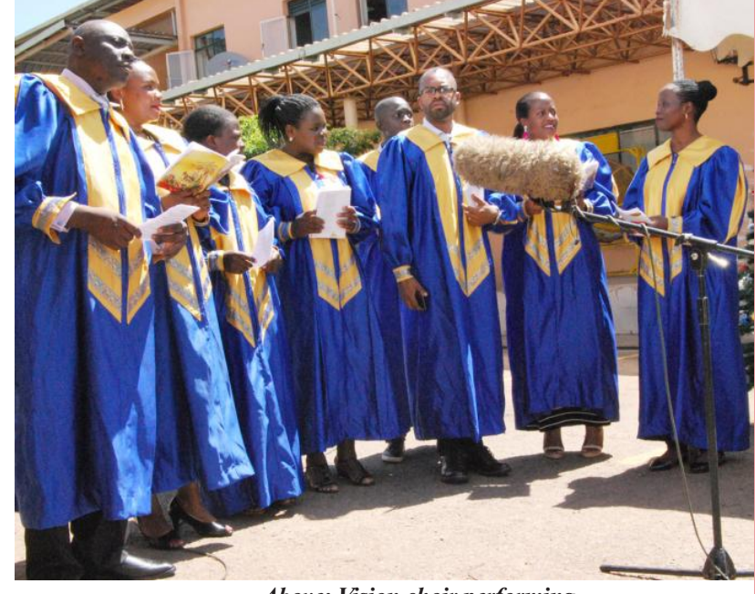
Above: Vision choir performing

On the left: Bishop switching on the Christmas tree