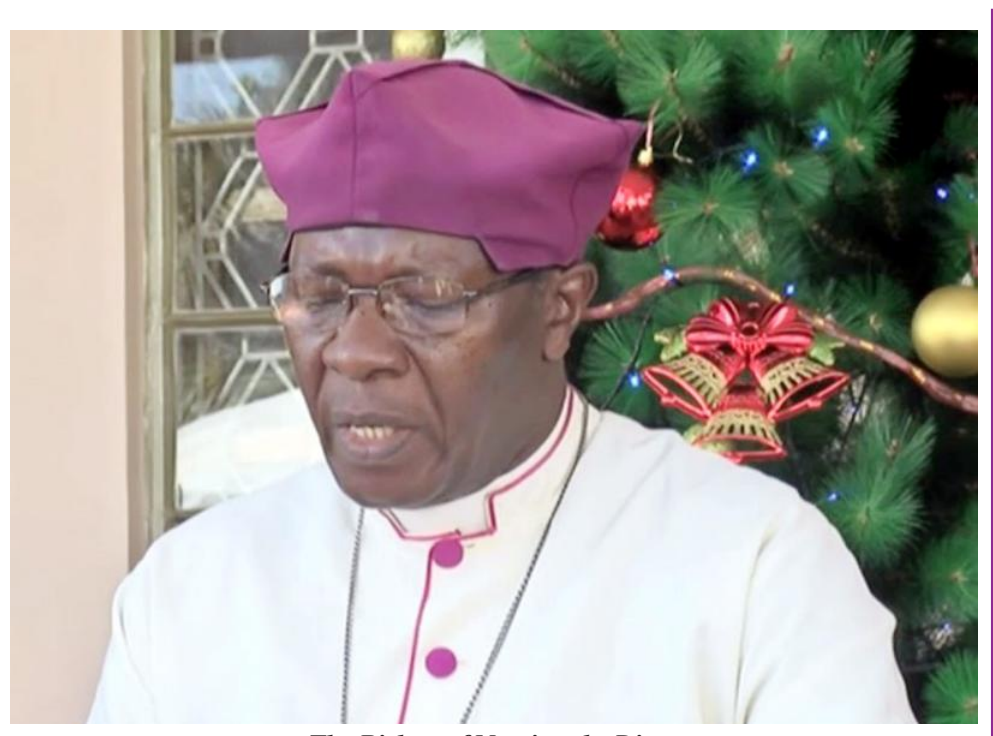
The Bishop of Namirembe Diocese.

'Where is he who has been born King of the Jews? For we saw this star when it arose and we have come to worship Him".