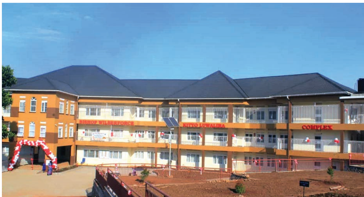
The Bishop Wilberforce Kityo Luwalira Complex at Gayaza Junior School Jjungo Campus