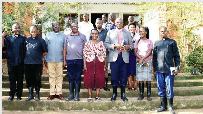
Diocesan staff at Sight Farm Namulonge for a study visit

It should be noted that Bishop Luwalira has supported the continued growth and development of Kyakwanzi Ranch which is on 3 square miles in Kyakwanzi District and has over 600 cattle plus 100 goats. New infrastructure has been put in place, modern farm equipments purchased solar system, water tanks, construction of valley dams, tik control plunge dip, purchase for new vehicle and motorcycle as well as increased cattle. The Bishop's passion for livestock and farming birthed the new Unit of farming which was integrated in the already existing Livestock Department headed by Dr. Fred Sengendo, the Diocesan Livestock Development Officer.