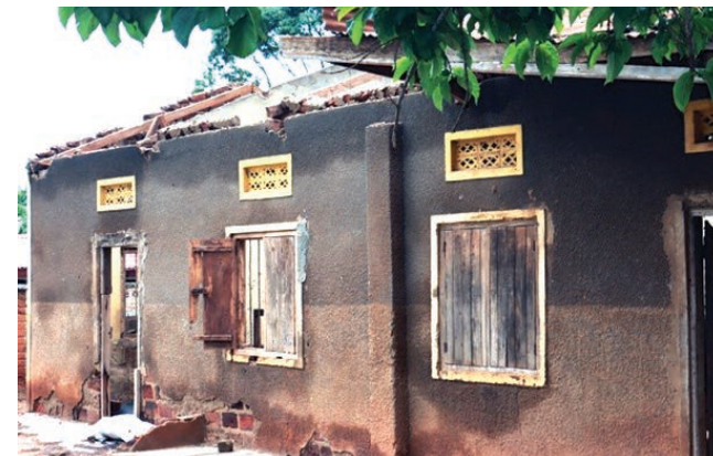
Some of the dilapidated school structures of Masuliita C.O.U Primary School