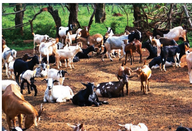
Some of the cattle and the goats at the ranch

The Bishop's love for farming and livestock has led to the rapid development of the Diocesan Ranch which sits on three (3) square miles in Kyankwanzi