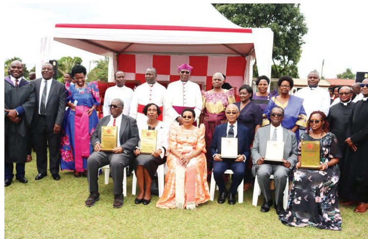
The IGG during the service and a group photo of the Bishop, IGG and the award winners