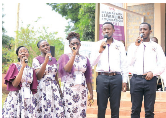
Bishop's family choir joins with the birth day song