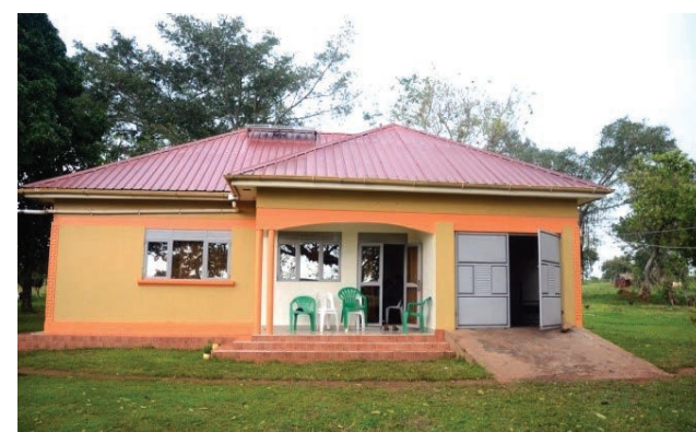
The modern house constructed at the ranch

to generate over Ugshs100million as income annually through cattle sale. He attributed this to cross breeding of the local cattle (Ankole) and the superior bulls birthing high quality breeds which are marketable. He also revealed that after the visit to Nakyasese Farm, Namulonge (National Research and Livestock Institute) organized by the Bishop in March, the Diocese looks forward to partnering with the Government to introduce modern reproductive technologies for cattle breeding and fattening thus leading to quality breeds. According to the ranch manager, this partnership will elevate the ranch to a greater level and it will be a centre of learning to the public. He encouraged the youth to utilize the opportunity of acquiring free knowledge and skills in modern Livestock farming by regularly carrying out study visits to farm.