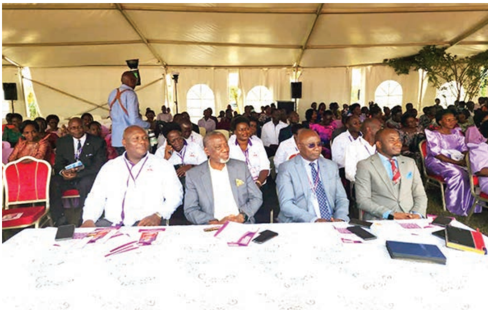
Some of the guests at the launch