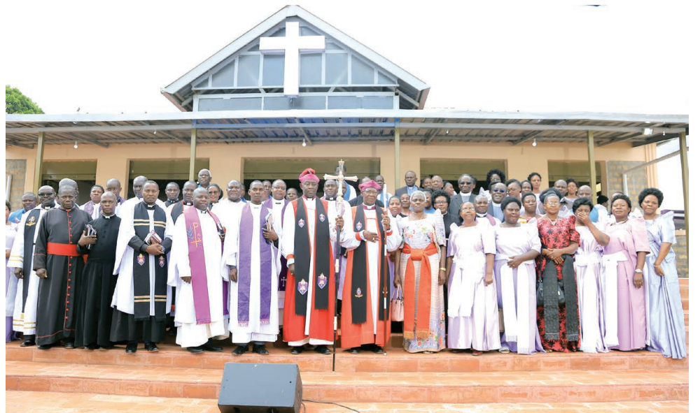
Clergy and their wives in one photo