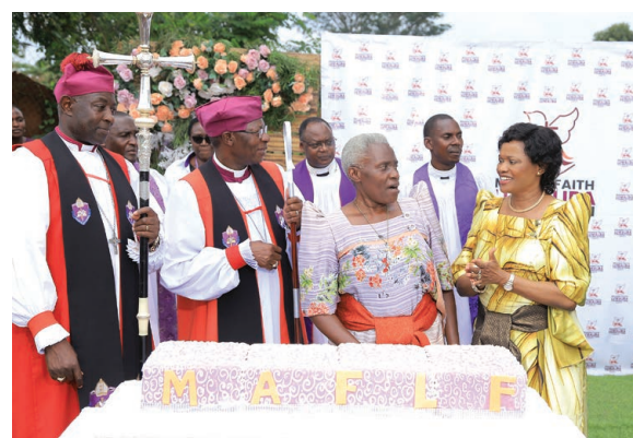
The excitement of cake cutting