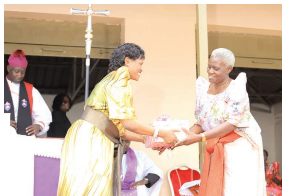
Maama Nnabagereka presenting her birthday gift