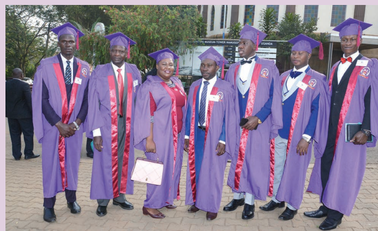
Some of the graduates in a group photo at the seminary

The Seminary also offers other programs including the Bachelor in Biblical Studies and Christian leadership,