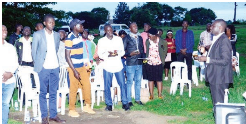
Youth leaders in their Annual Youth Retreat at Bugiri Youth Retreat Centre