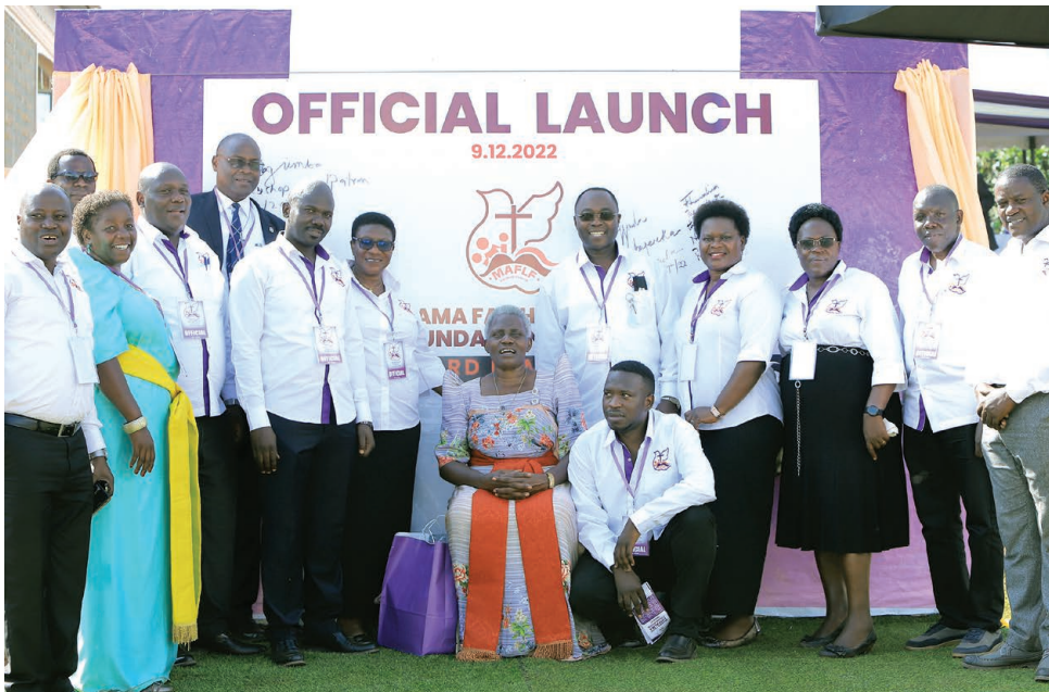
The MAFLF team