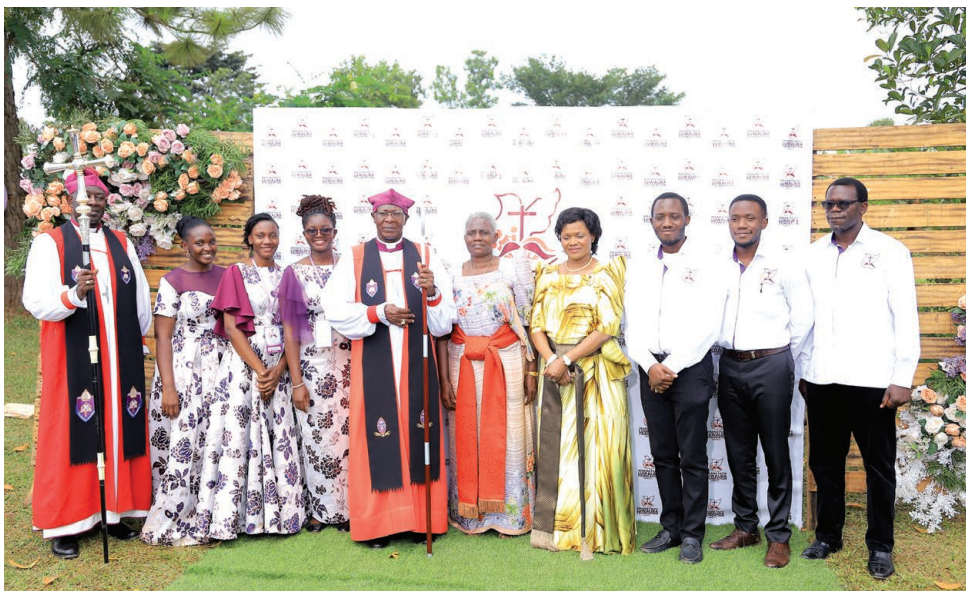
The Bishop's family join in a group photo