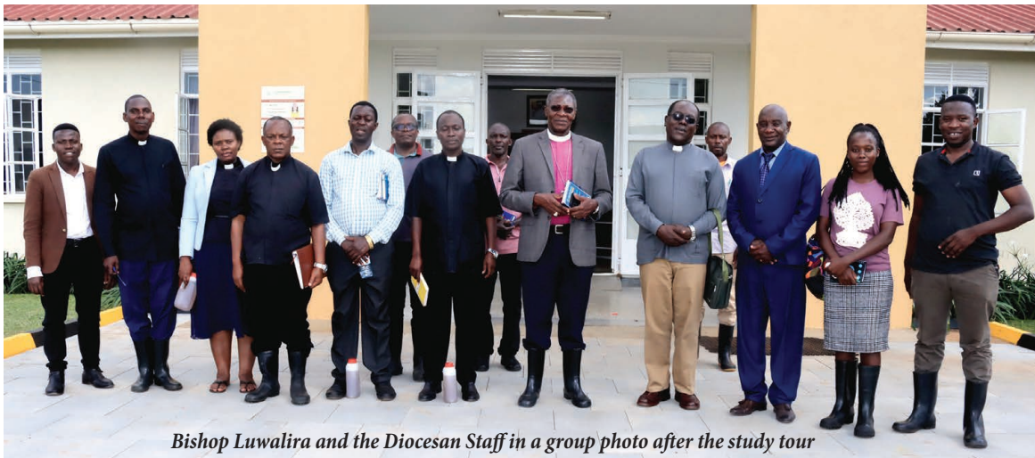
Bishop Luwalira and the Diocesan Staff in a group photo after the study tour

B ishop Wilberforce Kityo Luwalira led a team of staff for a study visit to Nakyesasa Farm (National Livestock and Research Institute) Namulonge on 24th March 2023 with an aim of learning new best practices in livestock keeping, knowledge and exposure.