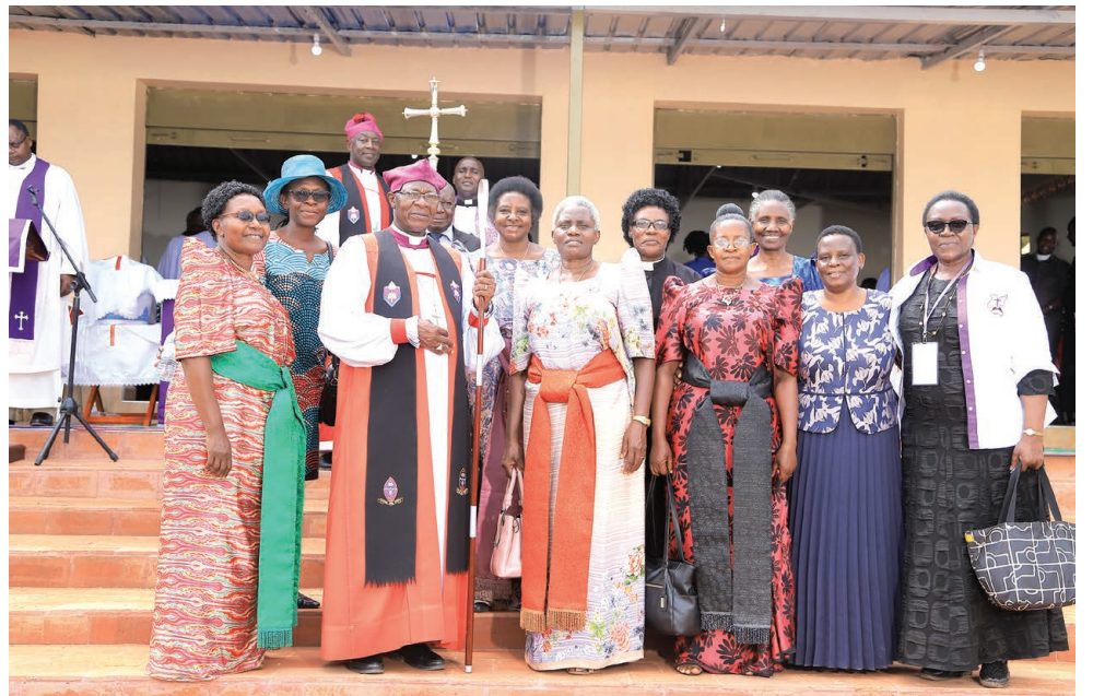
Some of the Shunamite Women