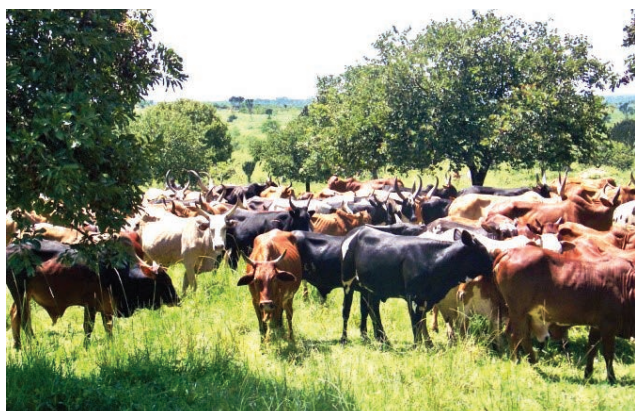
One of the valley Dams at the ranch