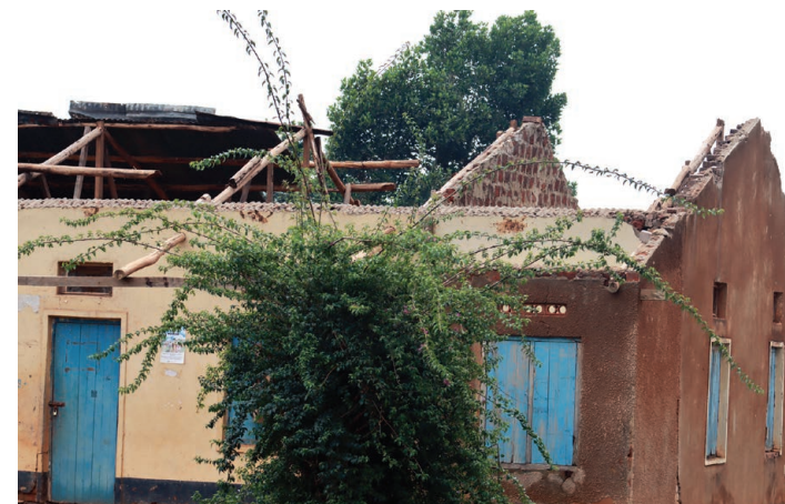
The damaged school structures by the heavy rains