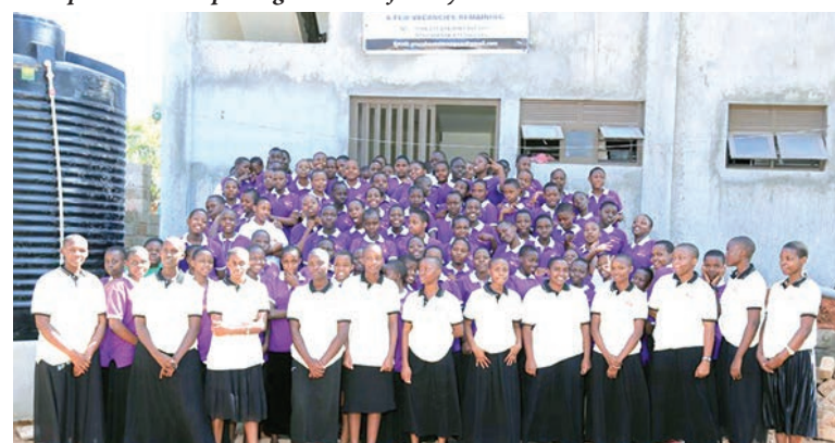
Some of the students at the hostel

confidence, humility and hard work which are key to success. This hostel is unique since it intends to offer programs such as career guidance, spiritual well being, counseling and guidance etc that build the girl child into responsible and God fearing student. This is in line with the hostel Mission Statement "Nurture a girl, Nurture a Nation", he added.