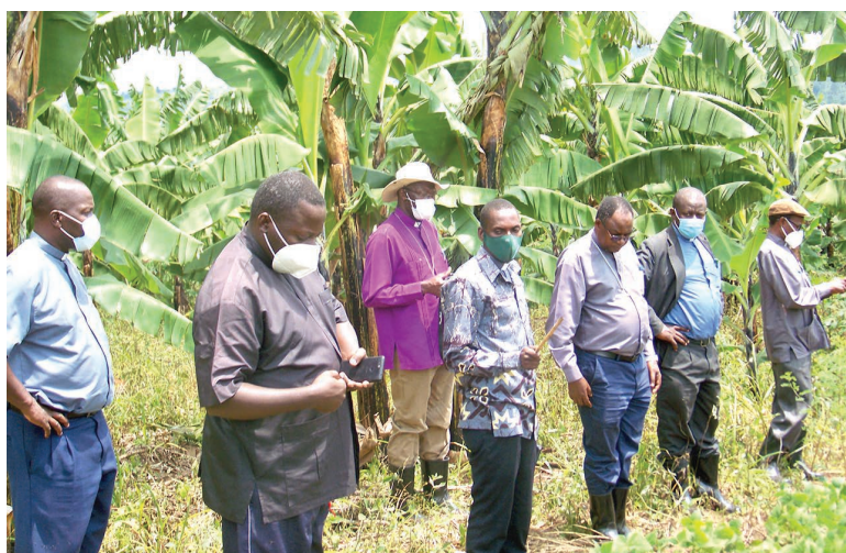
Bishop and the Archdeacons inspecting the Diocesan Banana plantations

The demand for food is extremely high in Kampala and the neighbouring communities and if our people are empowered to invest in