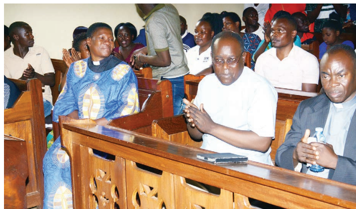
Youth performing at the Diocesan Annual Youth M.D.D Competitions