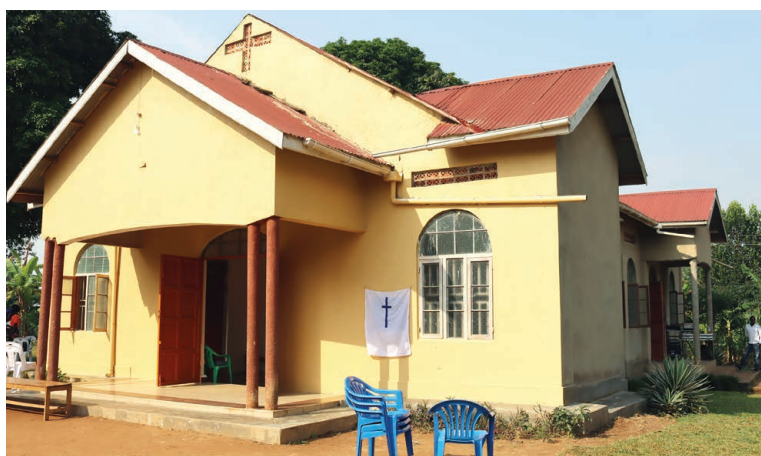
The exterior look of All Saints Church of Uganda Ggalamba