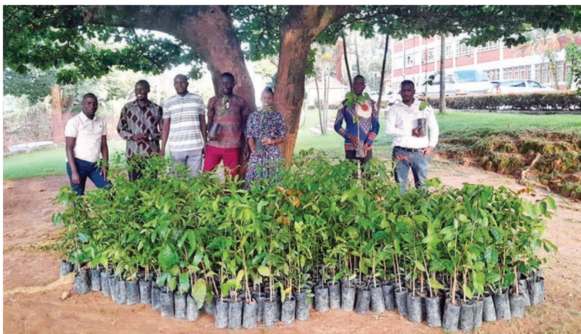
The 500 indigenous trees donated to the Diocesan Youth Department

I call upon all the youth to join this exercise and the clergy as well as the Lay Readers to support its realization for the good of our environment. Together it’s all our responsibility to create a safe environment for human living.