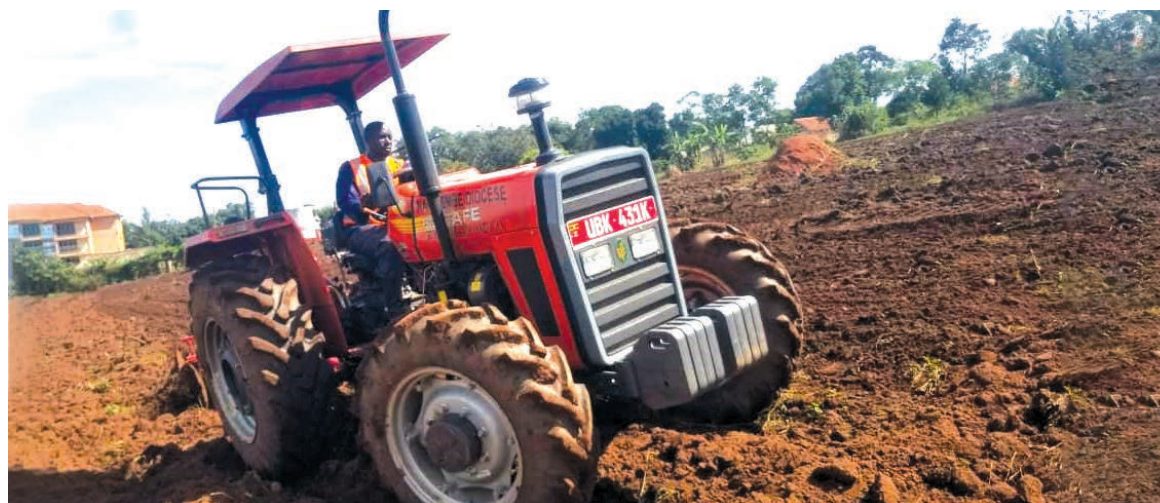
The Diocesan tractor during one of its field activities clearing land for farming